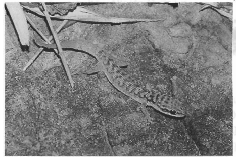
FIG. 6. Adult Dixonius hangseesom , sp. nov. in situ on limestone at Sai Yok, Kanchanaburi Province, Thailand.

Among the other reptiles found sympatrically with the types from Sai Yok are Cyrtodactylus peguensis , Gekko cf. siamensis , Gehyra fehlmanni , Calotes mystaceus , Lygo-