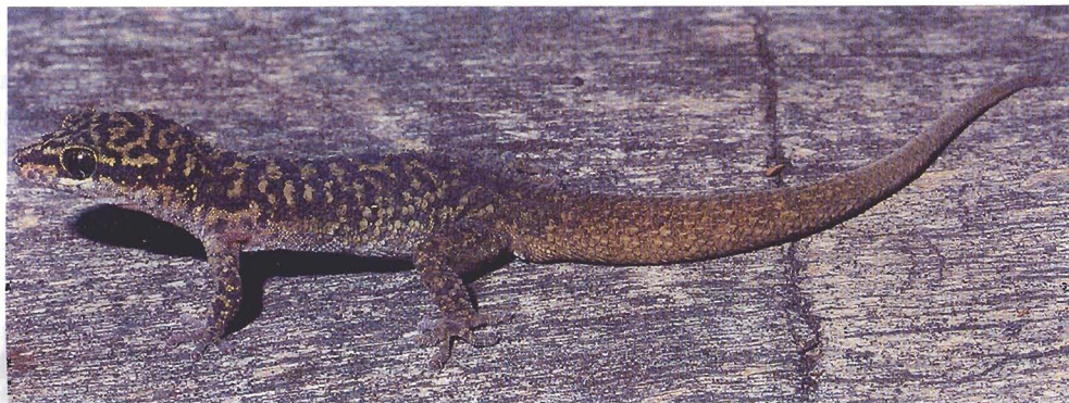
FIG. 5. Male paratype (ZMB 65437) of Dixonius hangseesom , sp. nov. after seven years and three months in captivity. Note the fusion of dorsal dark markings and the drab tail in comparison to the same specimen earlier in life (Fig. 4).

Dixonius hangseesom shares the dark eye stripe with D. melanostictus but unlike this form has a dorsal pattern with alternating light and dark markings (vs an essentially unpatterned dorsum, or pale stripes or longitudinal series of light spots), a greater number of midbody scale rows (12–14 rows of tubercles and 22–26 ventrals vs 10–11 rows of tubercles and 22 ventrals; Taylor, 1963), and smaller body size (maximum 42 mm SVL vs 50 mm SVL).