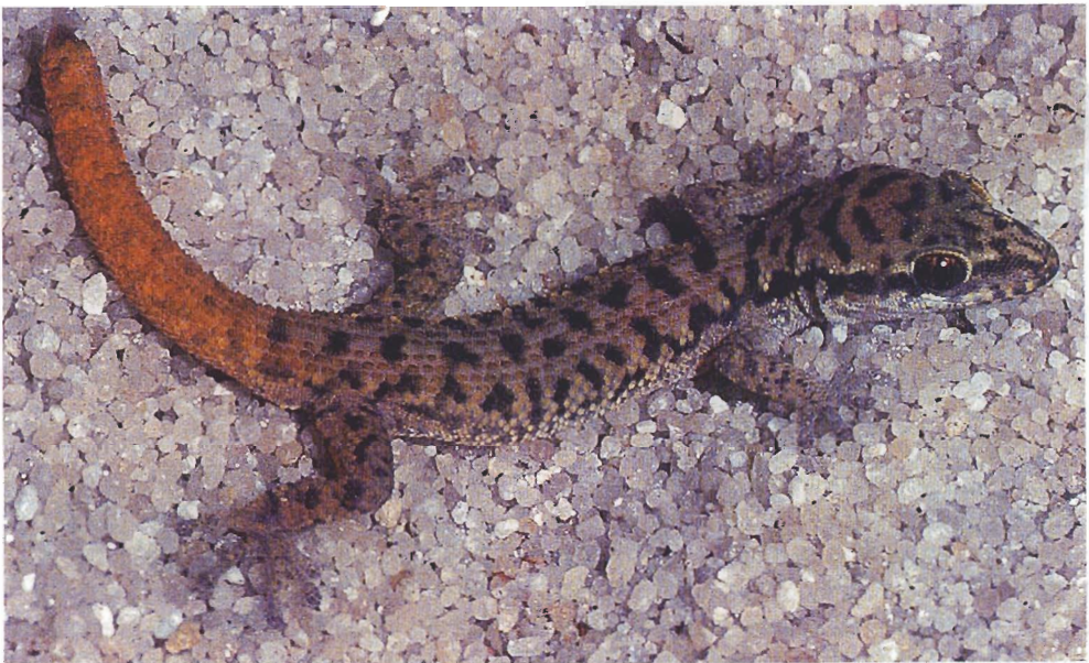
FIG. 4. Male paratype (ZMB 65437) of Dixonius hangseesom , sp. nov. shortly after capture as a 33 mm SVL subadult-adult. Compare tail coloration and dorsal pattern with Fig. 5.