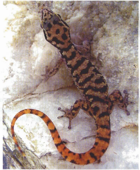
FIG. 3. Living specimen of adult male Dixonius hangseesom , sp. nov. from Sai Yok, Kanchanaburi Province, Thailand. Note the bright orange tail, crossbanded dorsal pattern and dark markings on sides of head.

D. burmanicus , should future research revalidate these taxa.